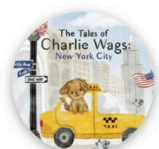
ALEX SIDNAM THE TALES OF CHARLIE WAGS: NEW YORK CITY