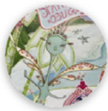
ANGELEAH DONAHUE AUTHOR OF QUEST FOR BRIGHTLAND