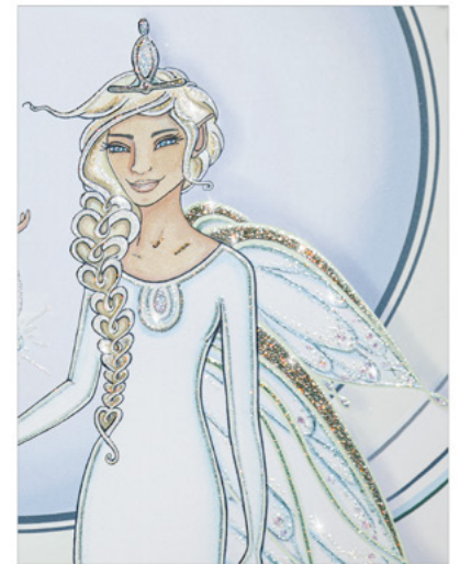
• CLOSE UP - SPOT GLITTER