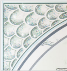
• CLOSE UP - SPOT GLITTER

- Angeleah Donahue, co-author and illustrator of Quest for Brightland Book 1: The Blessing Ball | @questforbrightland